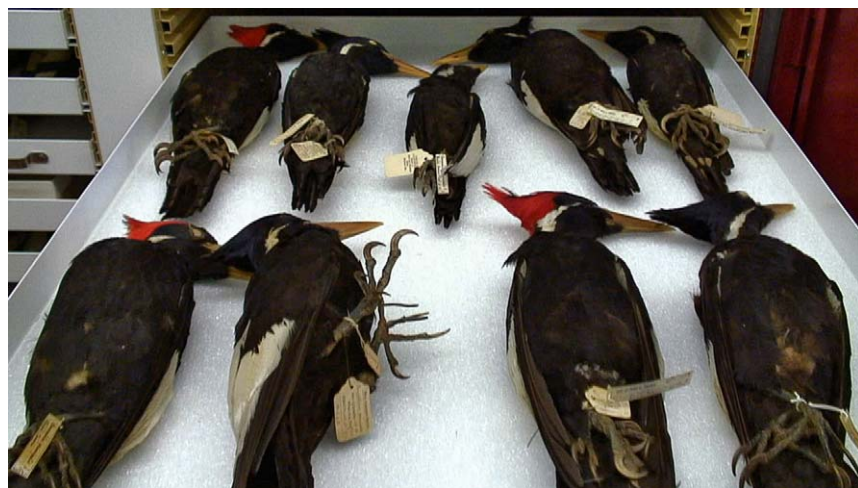
Figure 1. In a somber scene in Ghost Bird , workers at Harvard’s Museum of Comparative Zoology close drawer after drawer of Ivory-billed Woodpecker specimens, still and lifeless, evoking the chilling finality of extinction. doi:10.1371/journal.pbio.1000459.g002

Edwards notes that, more than for the other species, the extinction of the Ivory-billed Woodpecker may have been accelerated by collecting of scientific specimens. While this may be true, there are two important caveats that need to be considered: (1) cutting and severe fragmentation of the old growth forests almost certainly assured extinction of the Ivory-bill, and perhaps the Passenger Pigeon, with or without scientific collecting [6], and (2) laws did not protect these species during the 19th century, and collecting birds, their nests, and eggs was akin to collecting Beanie Babies or baseball cards during the late 20th century. Catalogs offered skins of Ivory-bills for sale, and entrepreneur hunters followed the loggers into the forest to collect the birds. Yes, more than a century ago scientists did collect some Ivory-bills, but institutions and government agencies were also involved in the collection of Ivory-billed Woodpeckers. Two of the last Ivory-bills known to have been collected were shot in 1924 in central Florida and sold to the Florida Museum of Natural History by two brothers with a permit from the state of Florida. The last I know of was shot by a Louisiana legislator to prove that the birds existed in the Singer Tract, a forest owned by the Singer